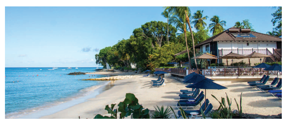
The beach at The Sandpiper

any of you will be aware that we spearheaded a beach restoration project on our stretch of the coast that involved several properties. The project initially resulted in a much wider beach but for a short period of time, things went awry and our beach suffered quite badly. We are thrilled to say that after pressuring the authorities to change the placement of the rocks, they have done as we requested and tweaked the groynes, which is a great improvement as the sand was able to come in to our beach and the beach returned within 48 hours. We are thrilled with the results and have opened with a beautiful new beach.