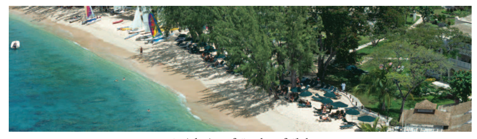
Aerial View of Coral Reef Club

ur American guests will be pleased to know that JetBlue currently flies a twice daily service from JFK to Barbados and is adding luxury flat beds to some time slots. Additionally JetBlue is adding flights from Boston and Fort Lauderdale and Delta is operating round trip flights from Atlanta and JFK. In addition to all the flights out of the U.K., Thomas Cook is starting flights from Glasgow with new cabins and Premium seats. The new airlift is particularly welcome from new destinations, making travel that much more convenient for some of you and all the better to see you!