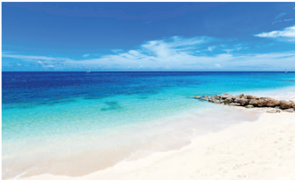
The Sandpiper's Beach

W e are happy to report that the final phase of this exciting project commenced in April of this year and was completed in November.